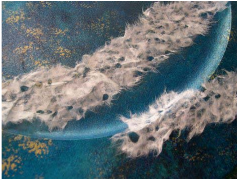
Close up of strips.