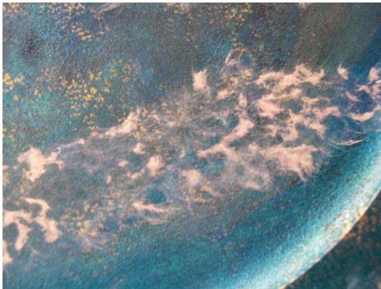
Strip glued down with LGM&V. It still looks like rice paper but some of the texture is fading into the background.